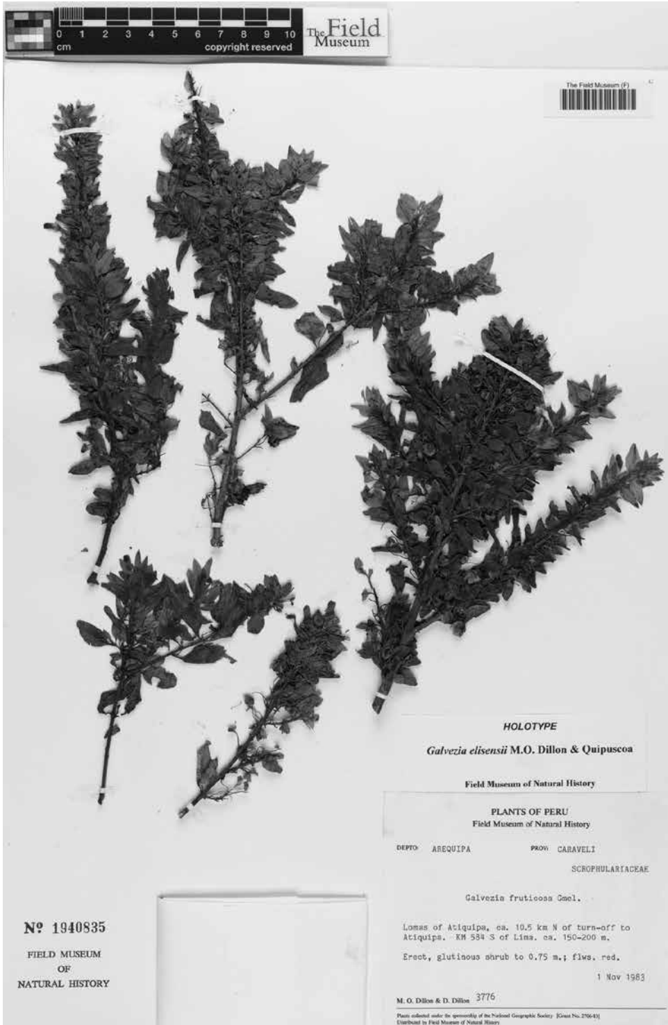
Fig. 1. Galvezia elisensii . Photograph of holotype collection, M. Dillon & D. Dillon 3776 (F1940835).